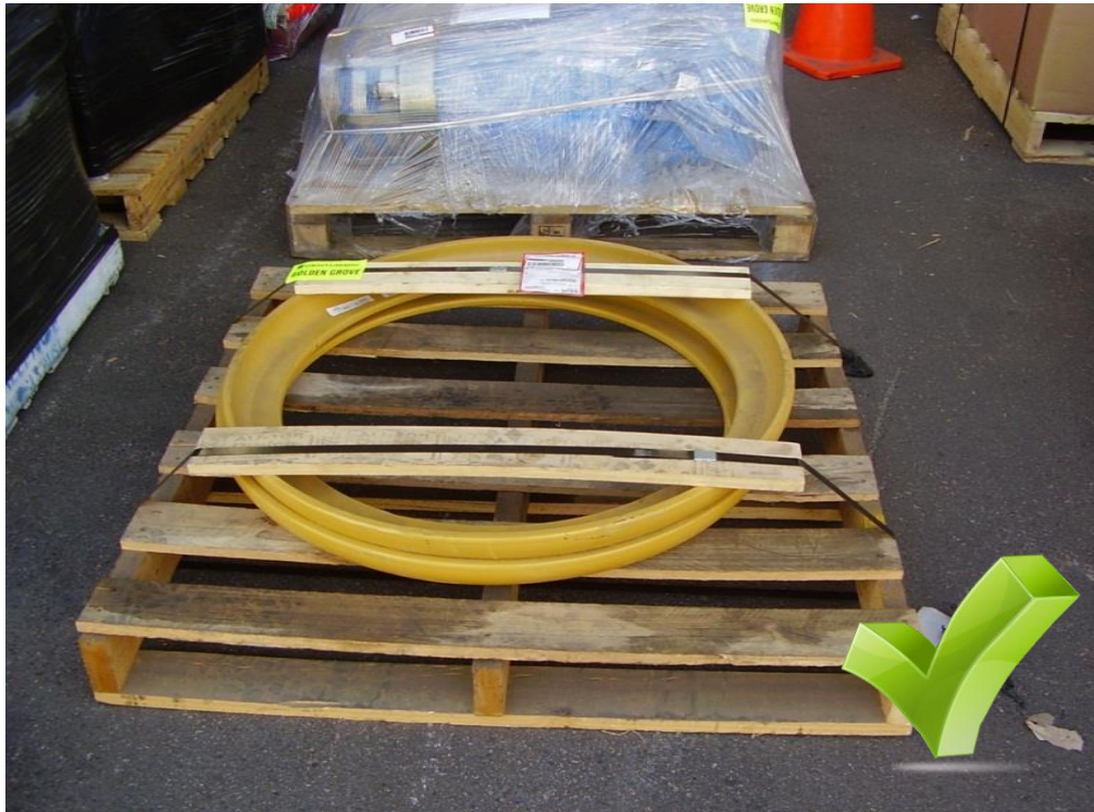
These well rods are suitably packed for transport and handling.