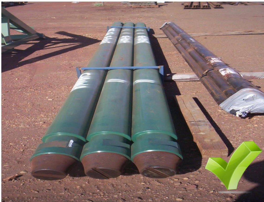
Well secured with metal banding that goes under the bearers of the pallet. The consignment has been protected to prevent the metal banding causing any damage.